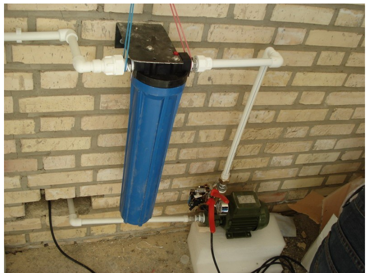
Rust filter prior to ELA-3 000ANW