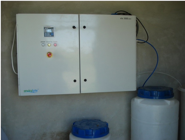
Envirolyte ELA-3 000ANW